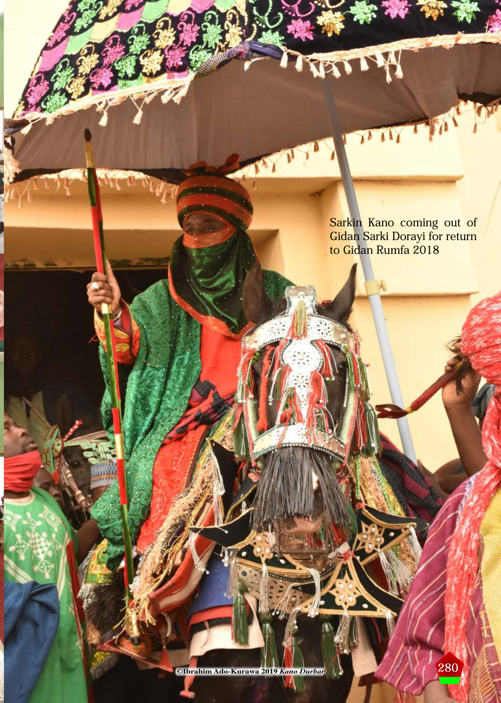
Sarkin Kano coming out of Gidan Sarki Dorayi for return to Gidan Rumfa 2018