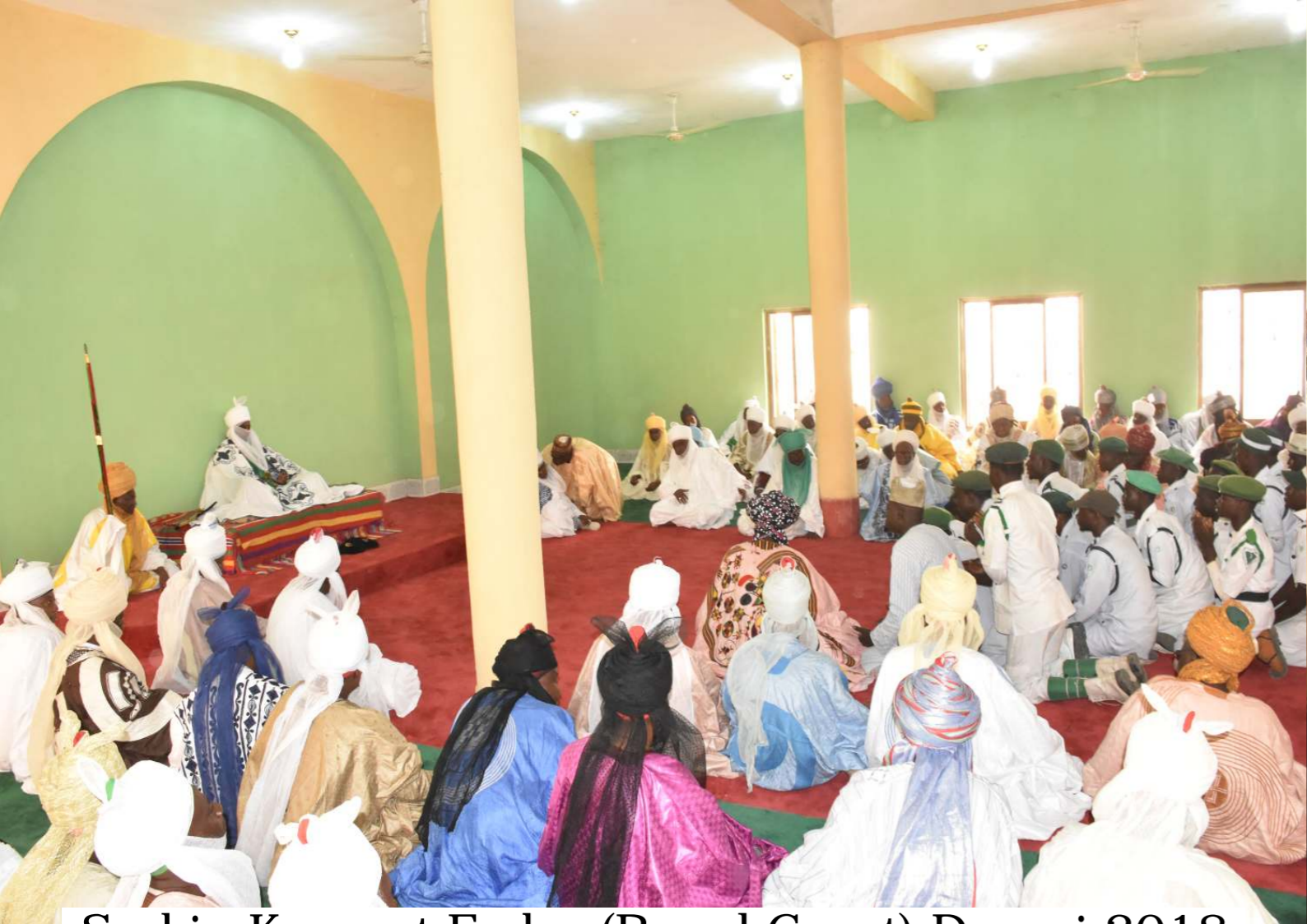
Sarkin Kano at Fadar (Royal Court) Dorayi 2018