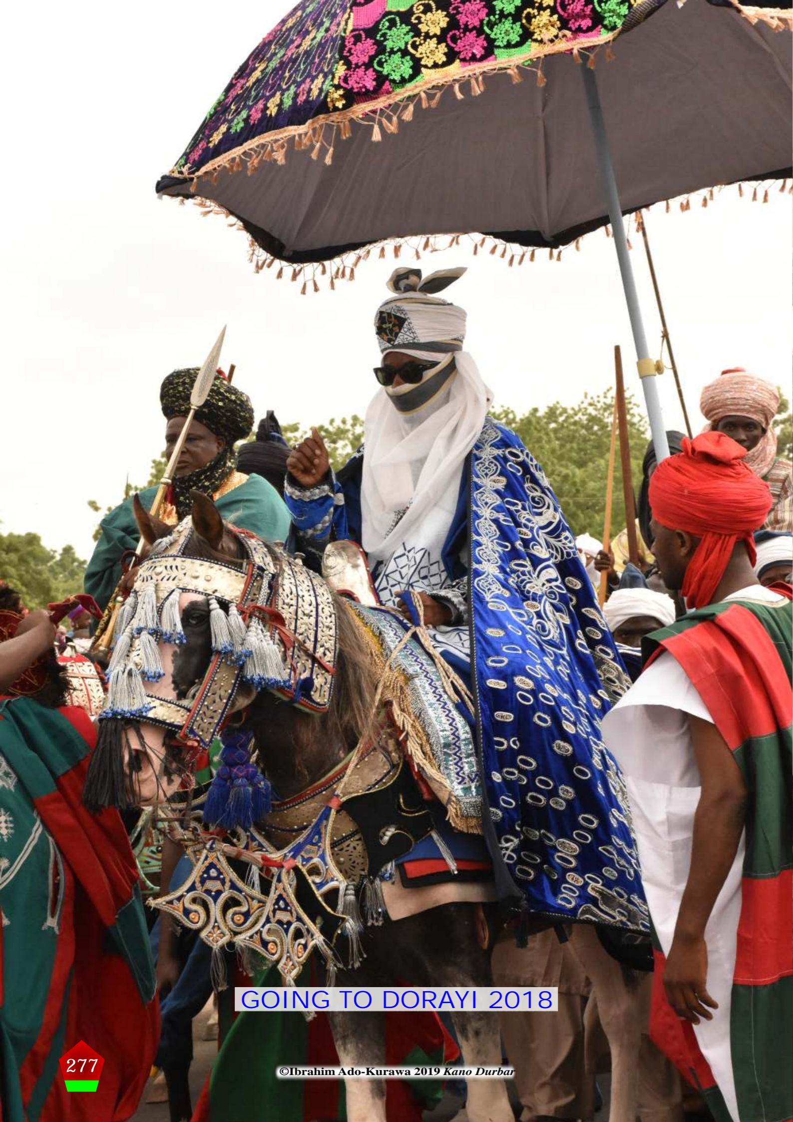
GOING TO DORAYI 2018