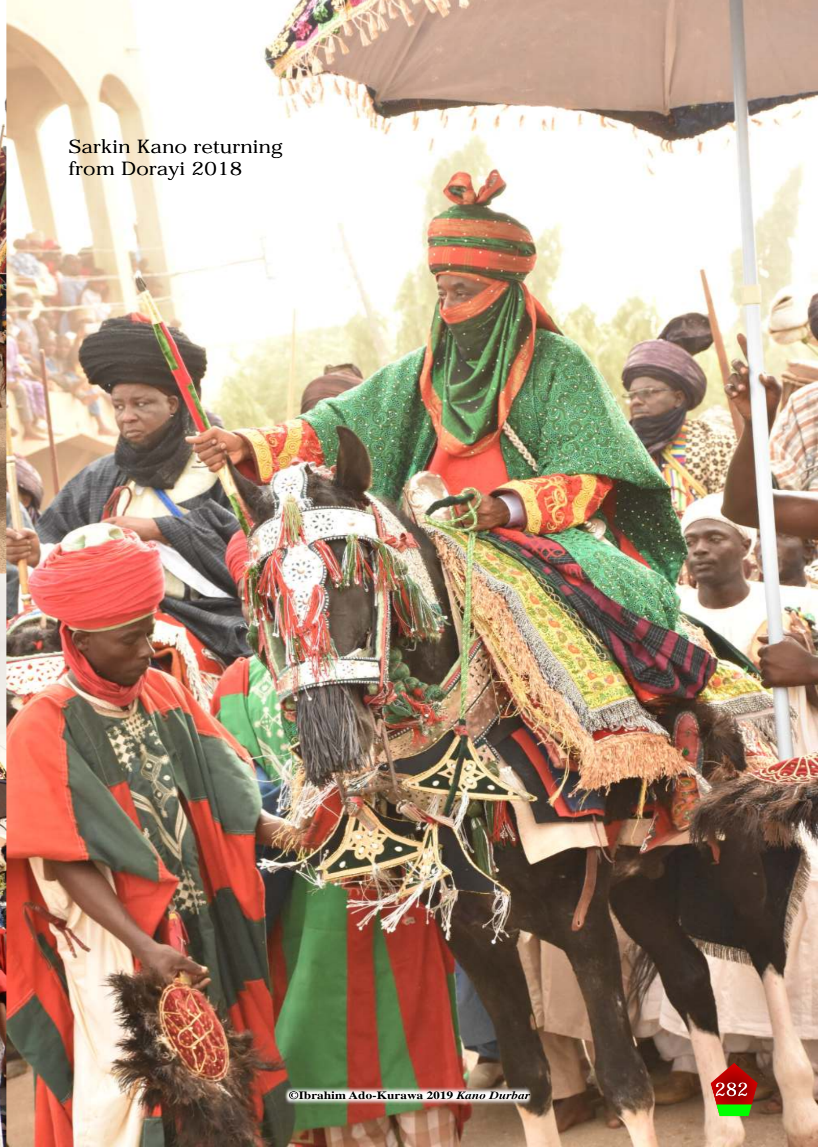
Sarkin Kano returning from Dorayi 2018