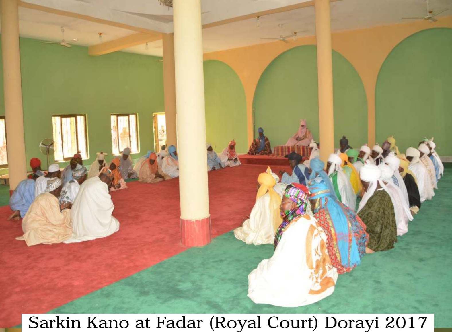
Sarkin Kano at Fadar (Royal Court) Dorayi 2017