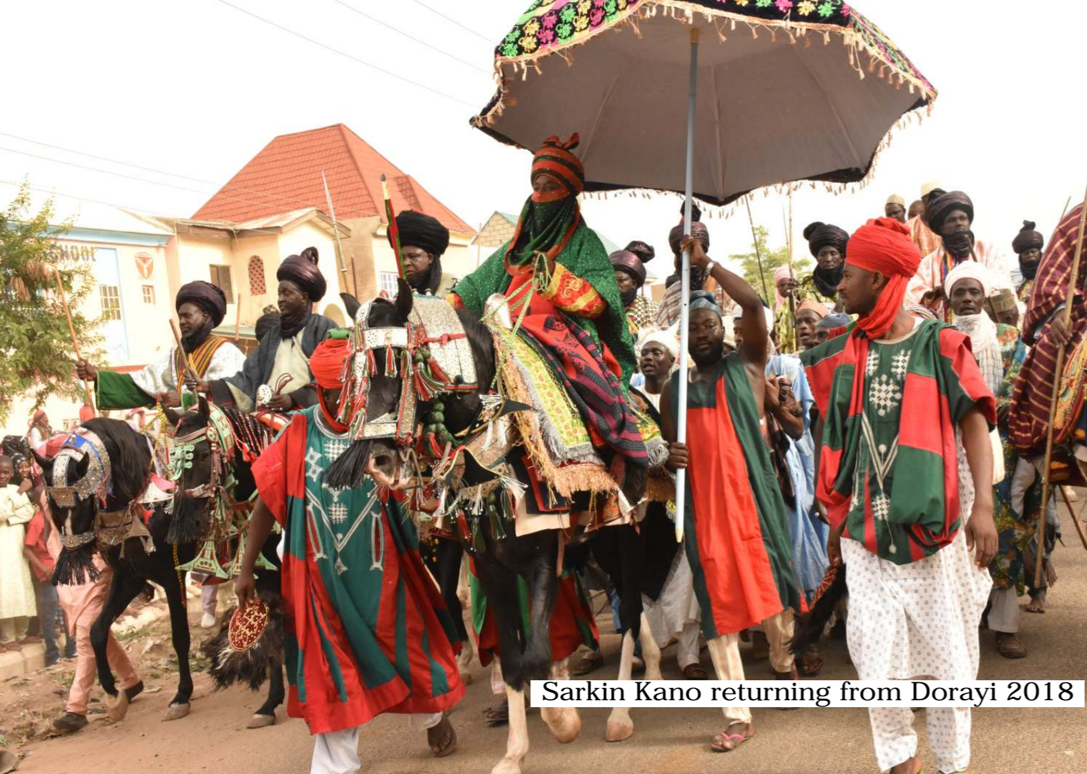
Sarkin Kano returning from Dorayi 2018