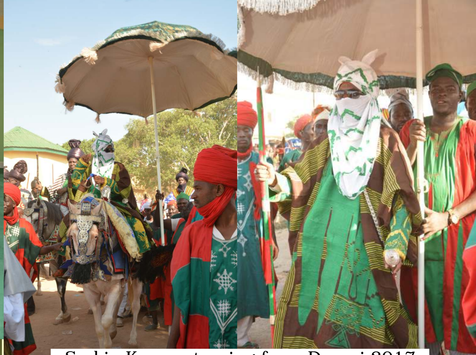
Sarkin Kano returning from Dorayi 2017