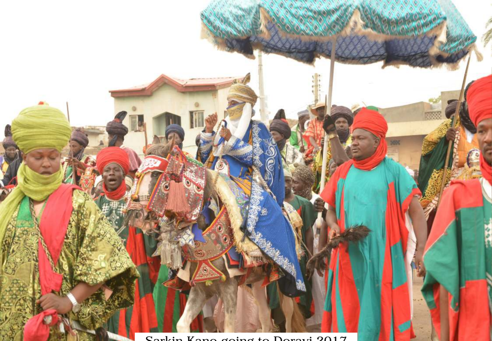
Sarkin Kano going to Dorayi 2017