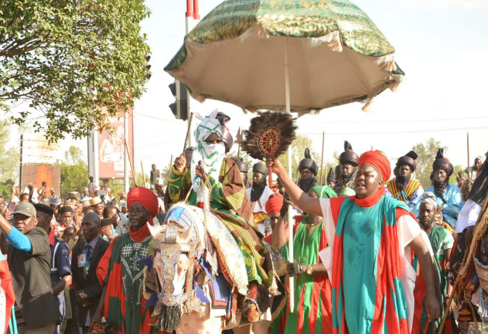
Sarkin Kano returning from Dorayi 2017