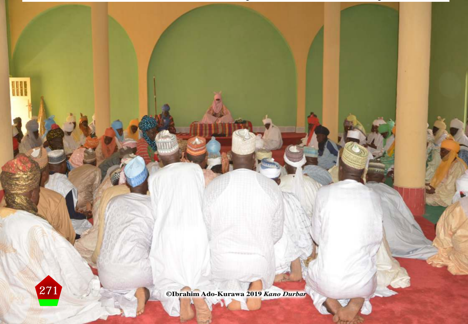
Kano Durbar