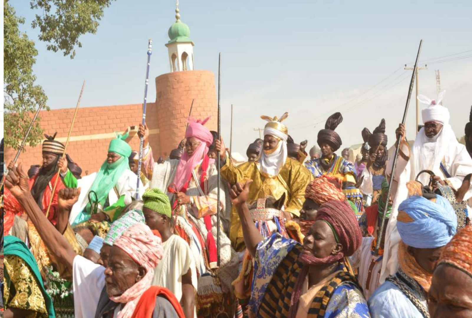
Hakimai 'Ya'yan Sarki (Princes) paying homage to Sarkin Kano at Dorayi