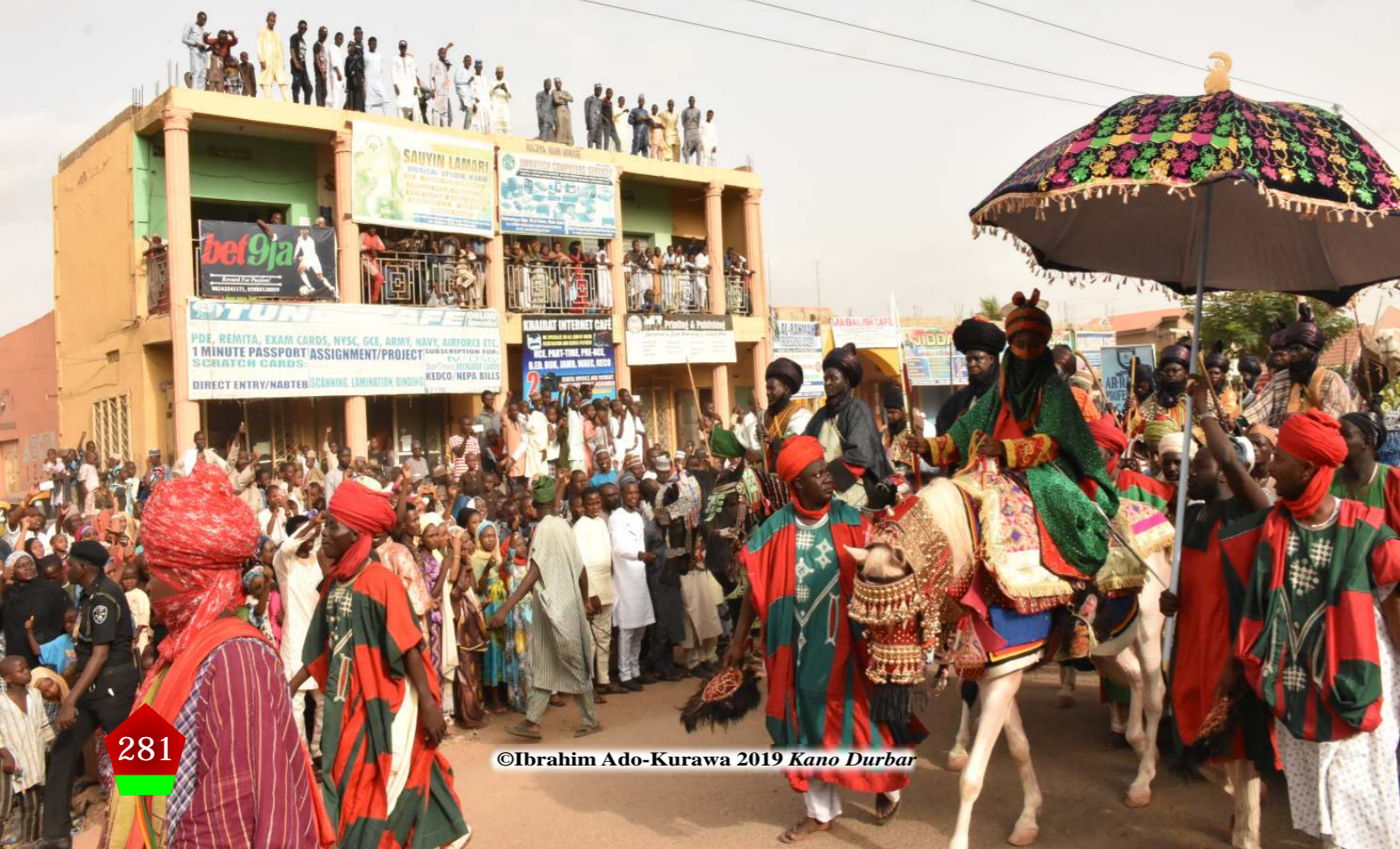
Kano Durbar