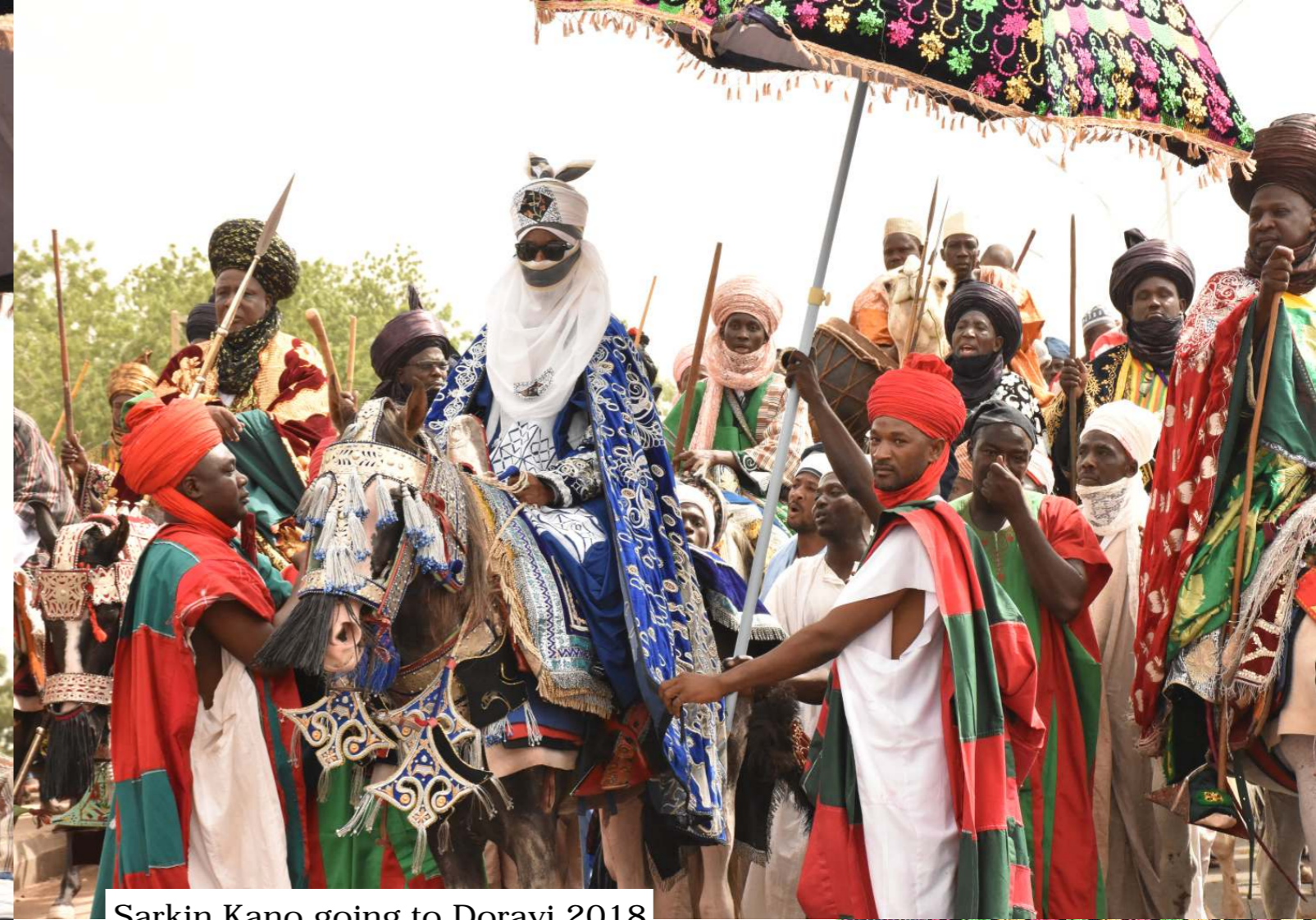
Sarkin Kano going to Dorayi 2018