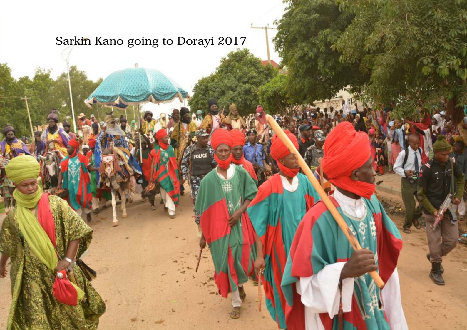
Sarkin Kano going to Dorayi 2017