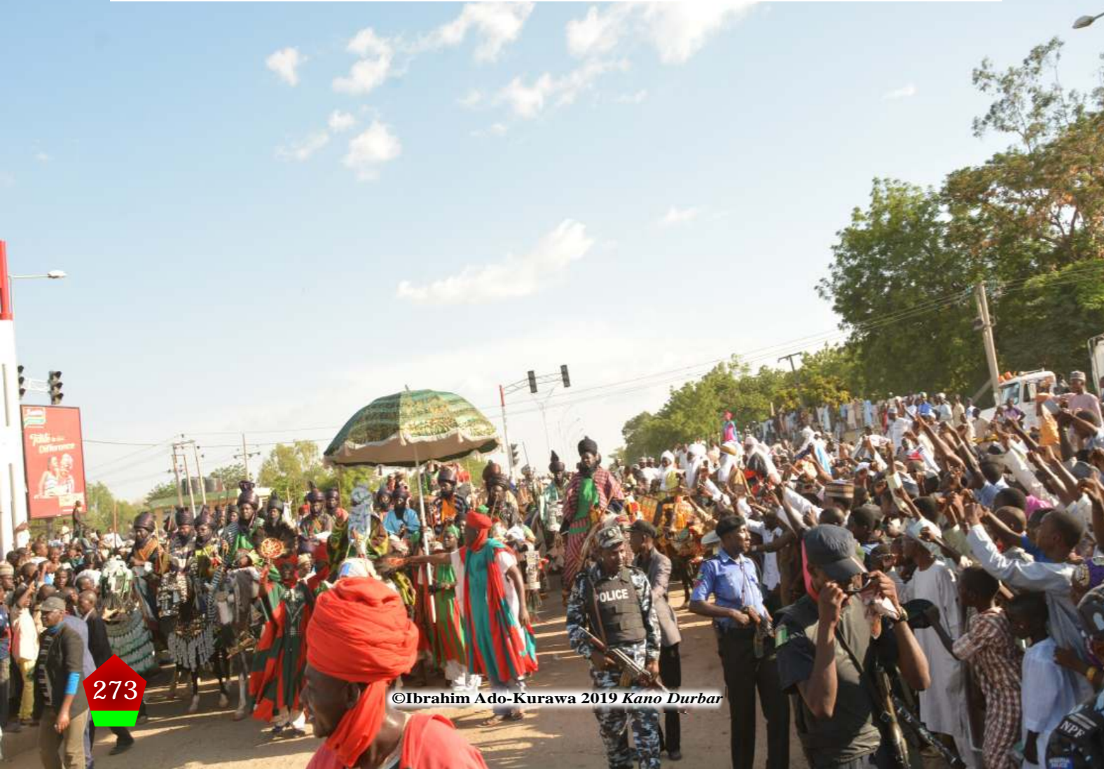
Kano Durbar