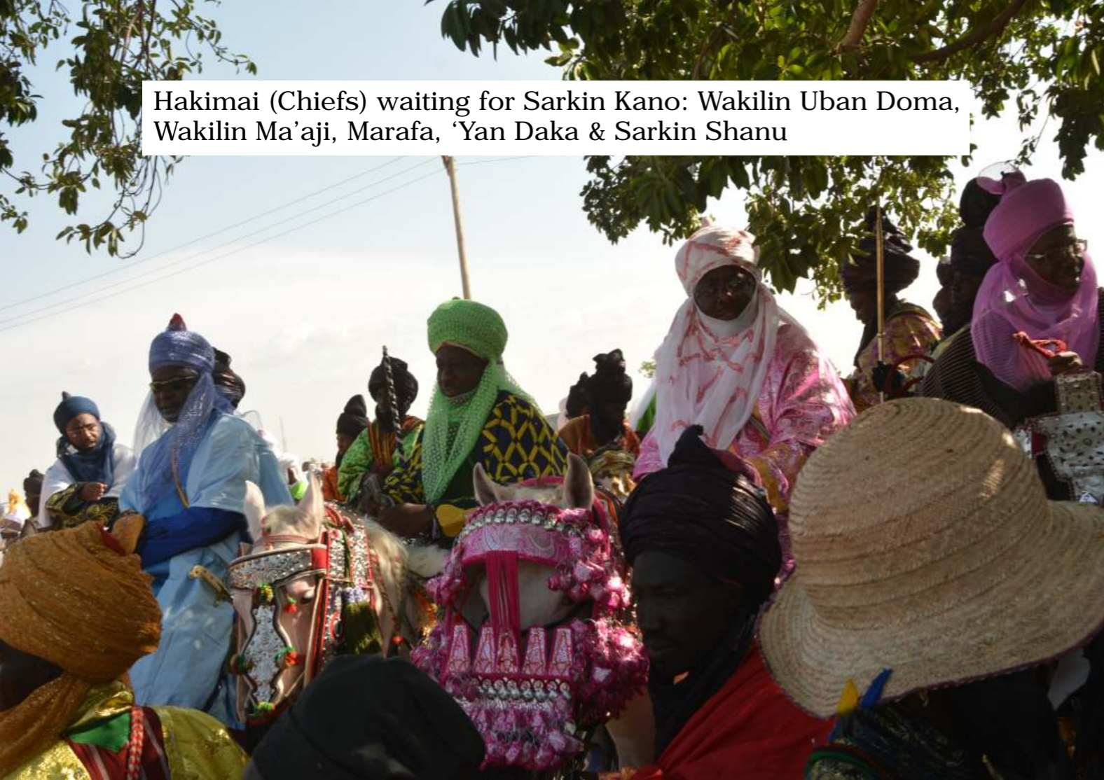
Hakimai (Chiefs) waiting for Sarkin Kano: Wakilin Uban Doma, Wakilin Ma'aji, Marafa, 'Yan Daka & Sarkin Shanu