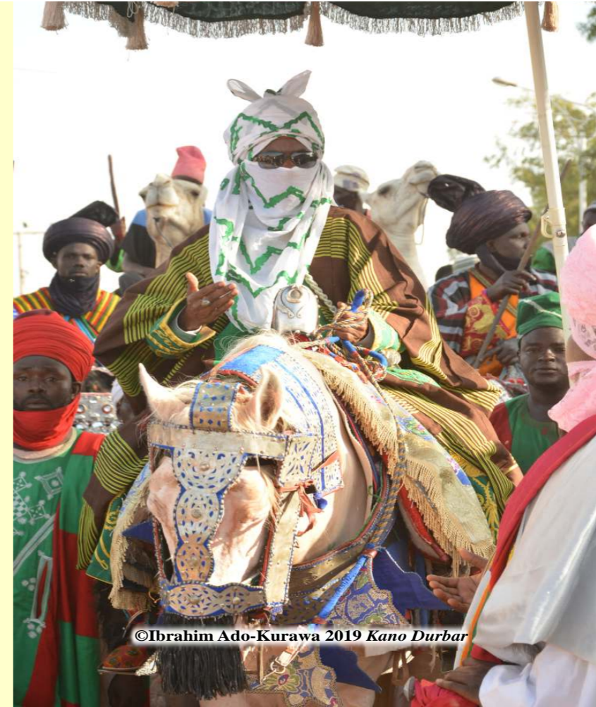
Kano Durbar