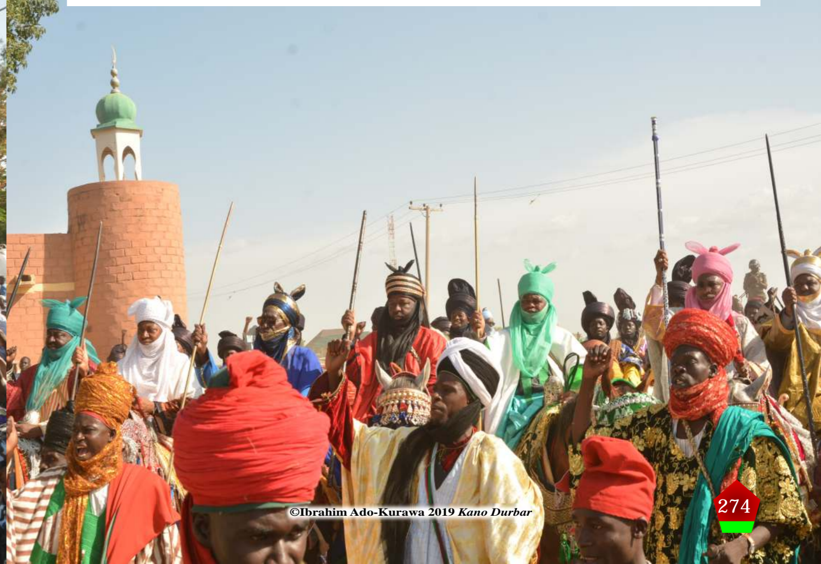
Kano Durbar