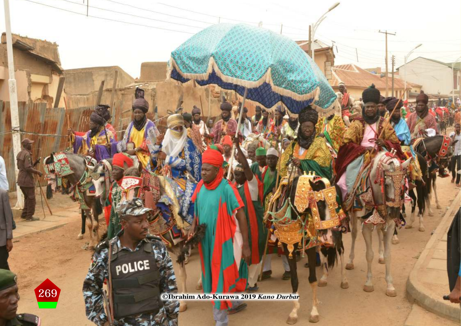
Kano Durbar